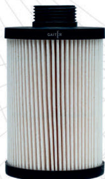
WATER SEPARATOR CARTRIDGE