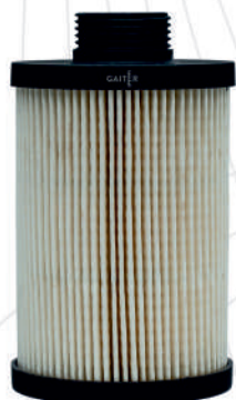
FUEL FILTER CARTRIDGE